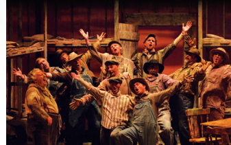
The Marriage of Figaro , Manitoba Opera, 2015.